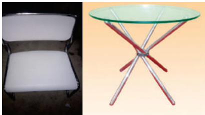
3 Chairs & Roundtable - Rs.3600