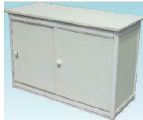
Lockable Table - Rs.2000