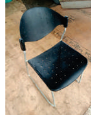
Standard Chair - Rs.500