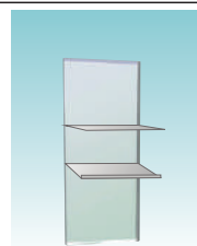
Shelf - Rs.450