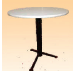
Steel Round Table - Rs.2000