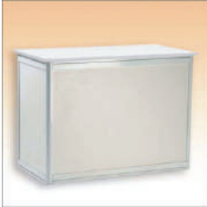
Octonorm Table - Rs.1000