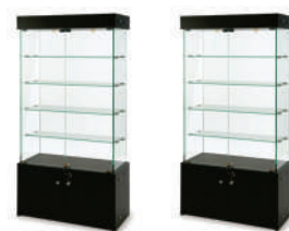
Glass Counter Tall - Rs.4500