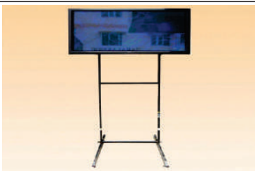
TV "42" - 4500