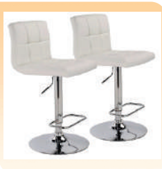
Hydraulic Bar Stool -Rs.1500 Each