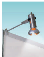
Spot Light - Rs.500